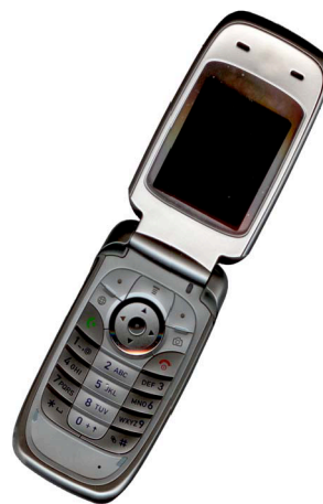
Fig. 3. Example of an image with acceptable resolution