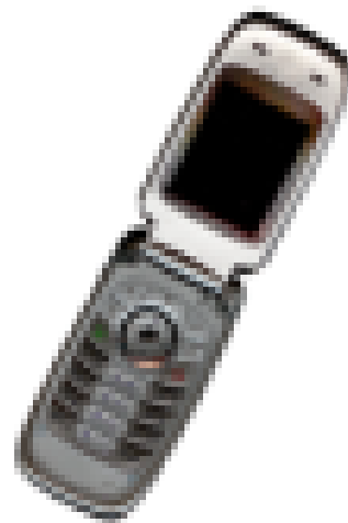
Fig. 2. Example of an unacceptable low-resolution image